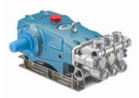
3535 (Rails sold separately)