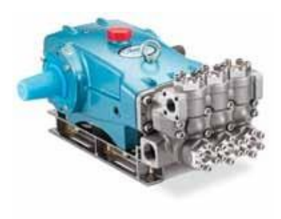
3511 (Rails sold separately)