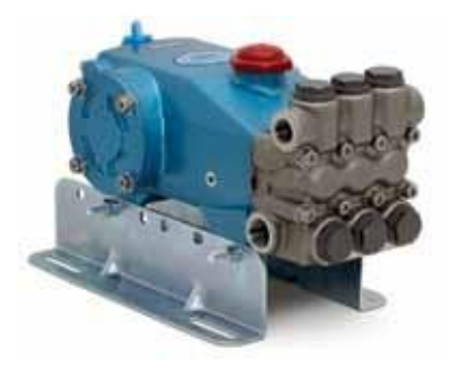
7CP6111 (Rails sold separately)