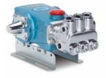
550 (Rails and shaft protector sold separately)