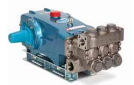
3531 (Rails sold separately)