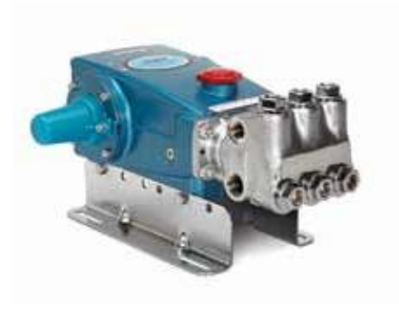
1050 (Rails and shaft protector sold separately)