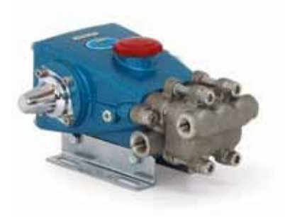
271 (Rails and shaft protector sold separately)