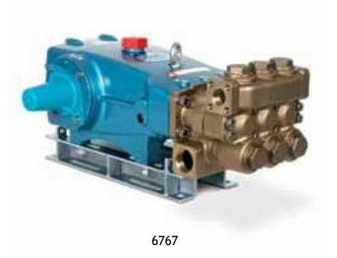
MAXIMUM FLOW MAXIMUM PRESSURE HORSEPOWER PUMP OPTIONAL <sup>1</sup> MODEL gPM LPM PSI BAR ΗP KW RPM DRIVES SEALS NICKEL ALUMINUM BRONZE MANIFOLDS WITH BUNA SEALS 2.3 TO 75 GPM (8.7 TO 284 LPM)