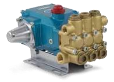
3CP1130 (Rails and shaft protector sold separately)