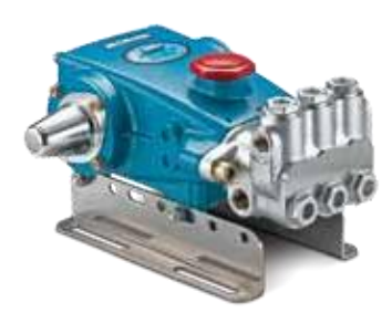
310 (Rails and shaft protector sold separately)