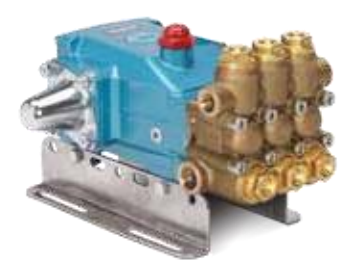
5CP3120 (Rails and shaft protector sold separately)