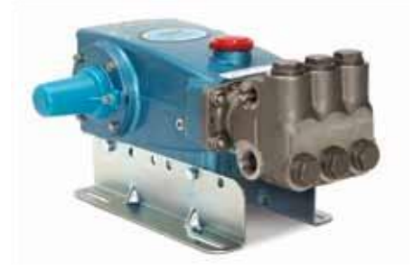
1051 (Rails and shaft protector sold separately)