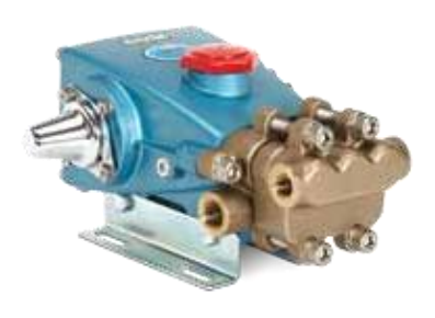
277 (Rails and shaft protector sold separately)