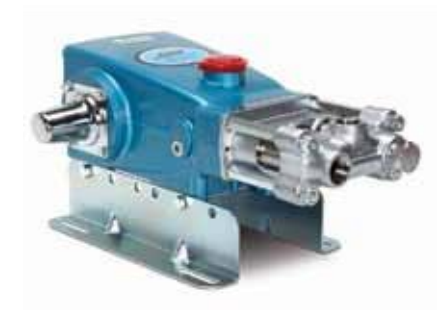
820 (Rails and shaft protector sold separately)