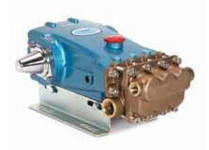
2537 (Rails and shaft protector sold separately)