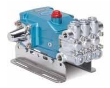
5CP2120W (Rails and shaft protector sold separately)