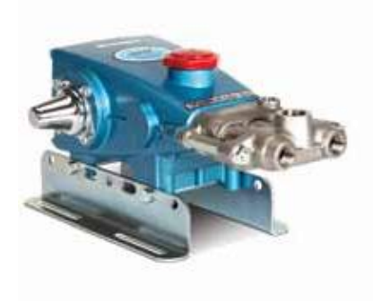
280 (Rails and shaft protector sold separately)