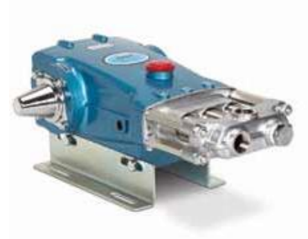
2520 (Rails and shaft protector sold separately)