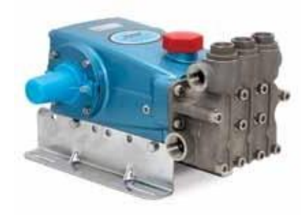
1541 (Rails and shaft protector sold separately)