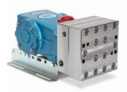
781 (Rails sold separately)