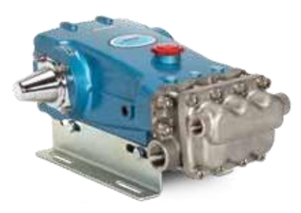
2531 (Rails and shaft protector sold separately)